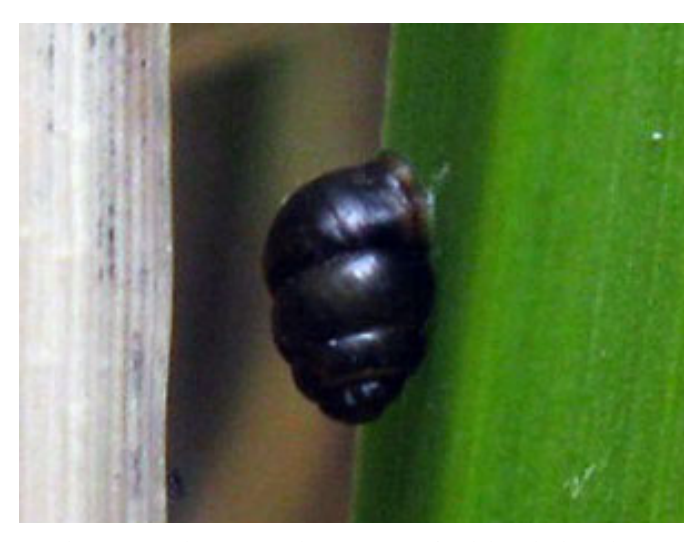
Fig. 3. Alive Vertigo moulinsiana on the grass in the vicinities of Velyka Glusha (plot 10).

The 33 specimens of V. moulinsiana (fig. 2) were collected in the two distant plots (at 5.5 km from each other) in fens, mainly alive from the vegetation, most frequently from the leaves of Carex spp. (fig. 3). Width of shell in collected specimens is 1.4–1.6 mm, height — 2.4–2.7 mm. Shell is ovate, dark brown or reddish, of 4.5–5 whorls. Aperture with broadly reflected margins, palatal incision, clear callus and 5–7 teeth: 1 parietal, 1 columellar, 1 basal, 2 palatal and often also additional small parietal and/or palatal. This is clearly corresponding to the descriptions of V. moulinsiana and within the known variability of this species (Pokryszko, 1990; Balashov, 2016 b).