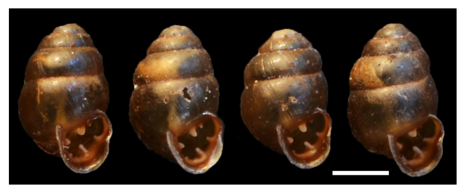
Fig. 2. Shells of Vertigo moulinsiana from the vicinities of Velyka Glusha (plot 10), scale bar 1 mm.